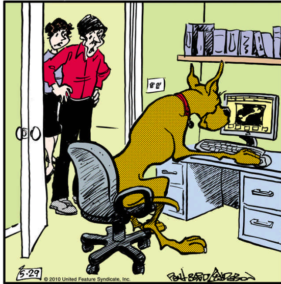
"Why can't he just be satisfied with a squeak toy?"